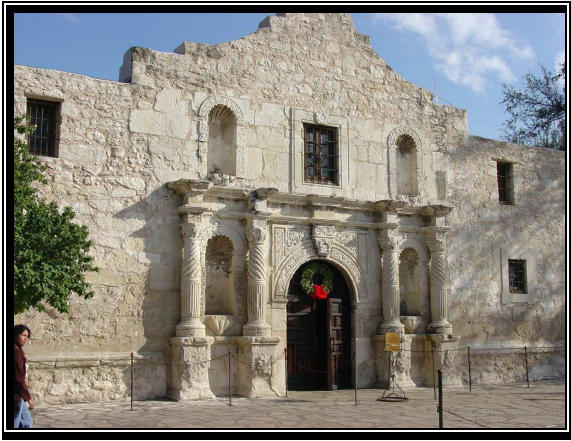
The Alamo – December 2003